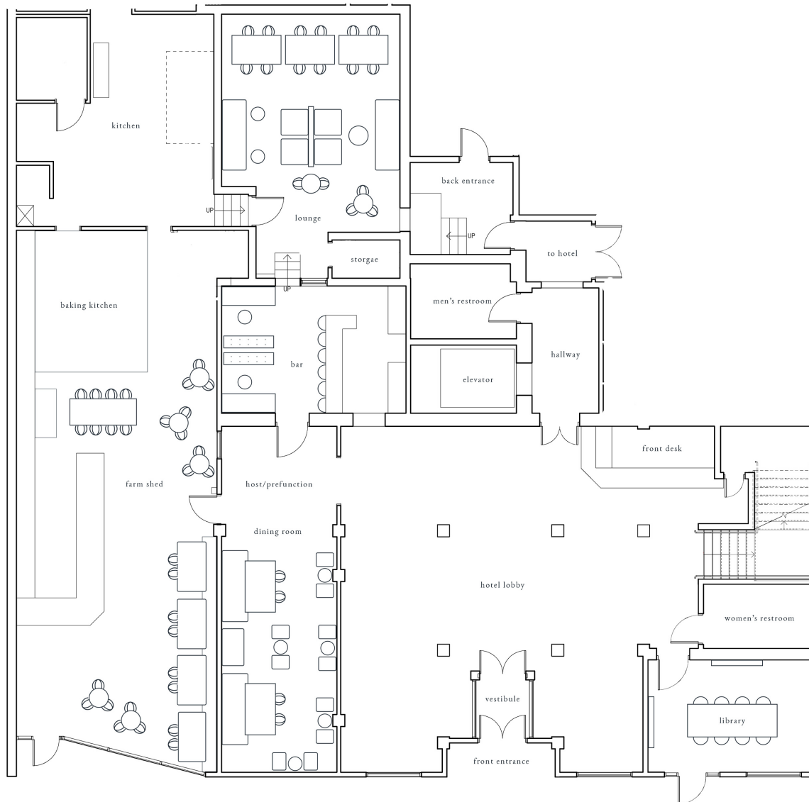
The Black Hawk Hotel | Eagle View Hospitality