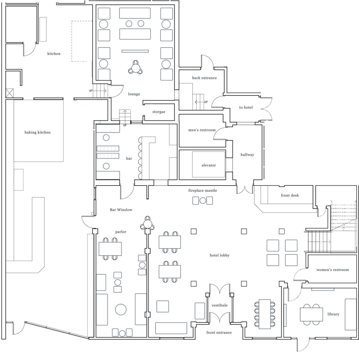
The Black Hawk Hotel | Eagle View Hospitality